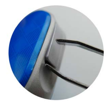
1. use forceps open the card slot