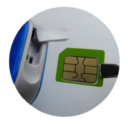
2. Chip up insert the mobile phone card